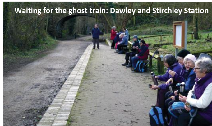
Waiting for the ghost train: Dawley and Stirchley Station

From the Information Centre walk a few yards to the picnic tables behind the old chapel. Take the path just to the left of the lake parallel to the tarmac road, you should see a large Information Board about the Trail marking the start of the Trail here.